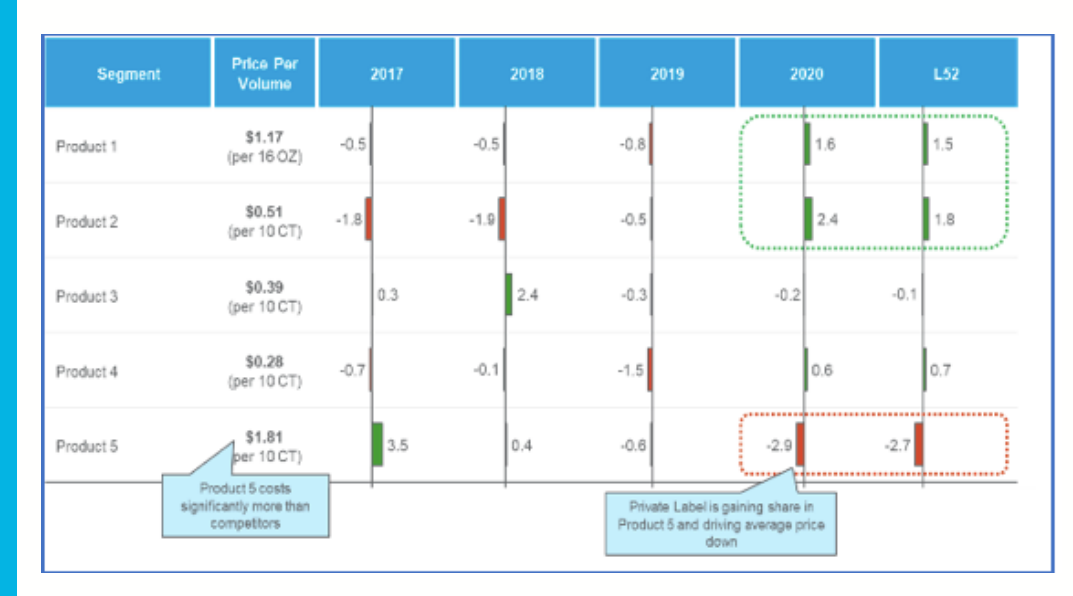
Exhibit 3: Assessing Product Power

In the current, highly competitive deal environment, a rapid MPA can substantially enhance the short-term value creation effort by identifying actionable near-in opportunities to drive both revenue and EBITDA. Leading PE firms have embraced MPA not just to evaluate and rightprice the asset but to lay the foundation for growth and EBITDA improvement in the first 180 days after acquisition.